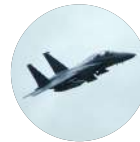
Aerospace DO-178B/C, DO-254