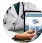
Medical Devices & Pharma IEC 62304, FMEA and GAMP5