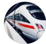
Railroad CENELEC EN 50128 and FMEA